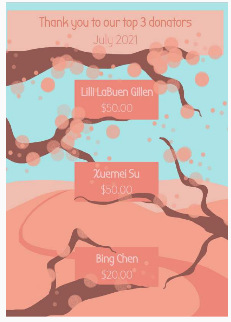
Thank you, everyone, for supporting the ICC, if you would like to donate, feel free to visit our website at irvinecoding.club and help by donating a few dollars! Your generous donation will immediately appear on our donations tab.

Best of luck to all our aspiring lecturers!